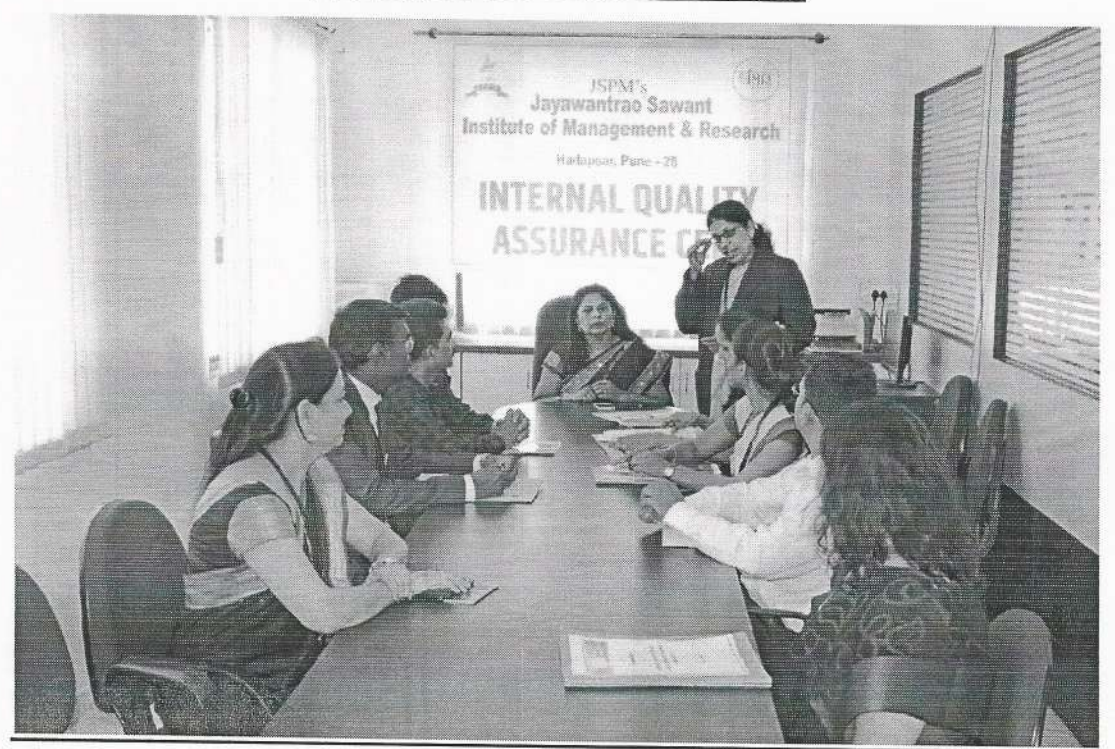
(IQAC meeting held on 14th June 2018 at 11am in board room)