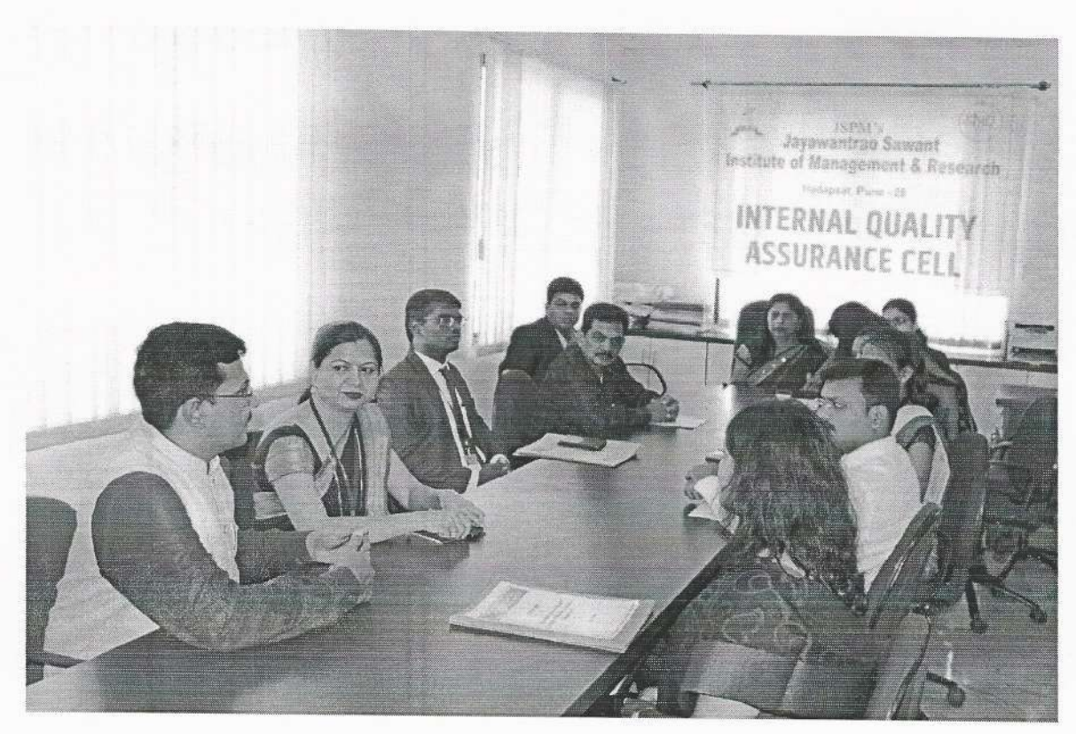
(Members of IQAC sharing their inputs)